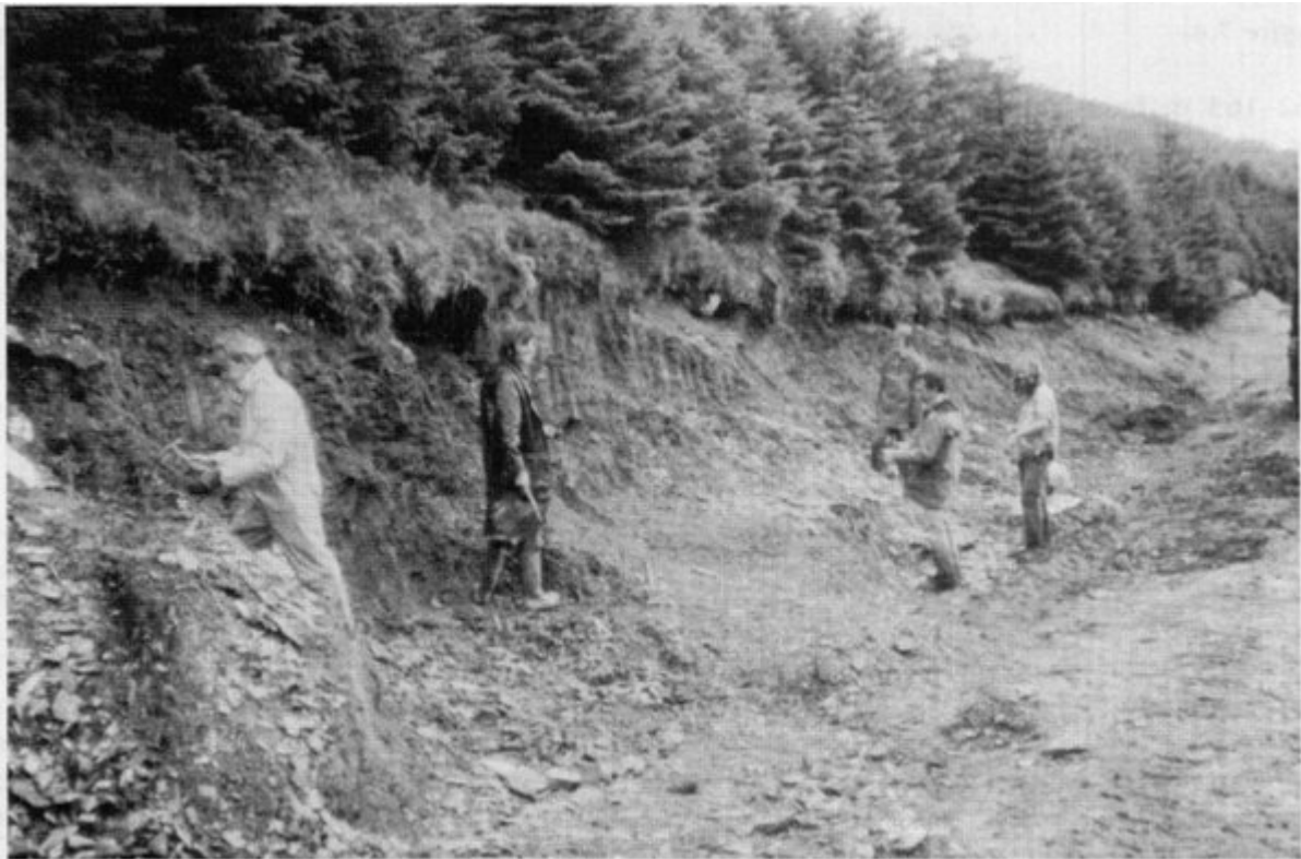
(Figure 7.3) Bryn-llin-fawr, as excavated in 1978, looking south. The figure on the left is working at the Rhabdinopora beds at the base of the Dol-cyn-afon Formation which dip to the left and strike towards the viewer. The next figure stands near the volcanoclastic sandstone beds that lie close to the boundary between the Merioneth and Tremadoc series. The other figures stand near the top of the Dolgellau Formation, on the beds with the Acerocare Zone fauna.