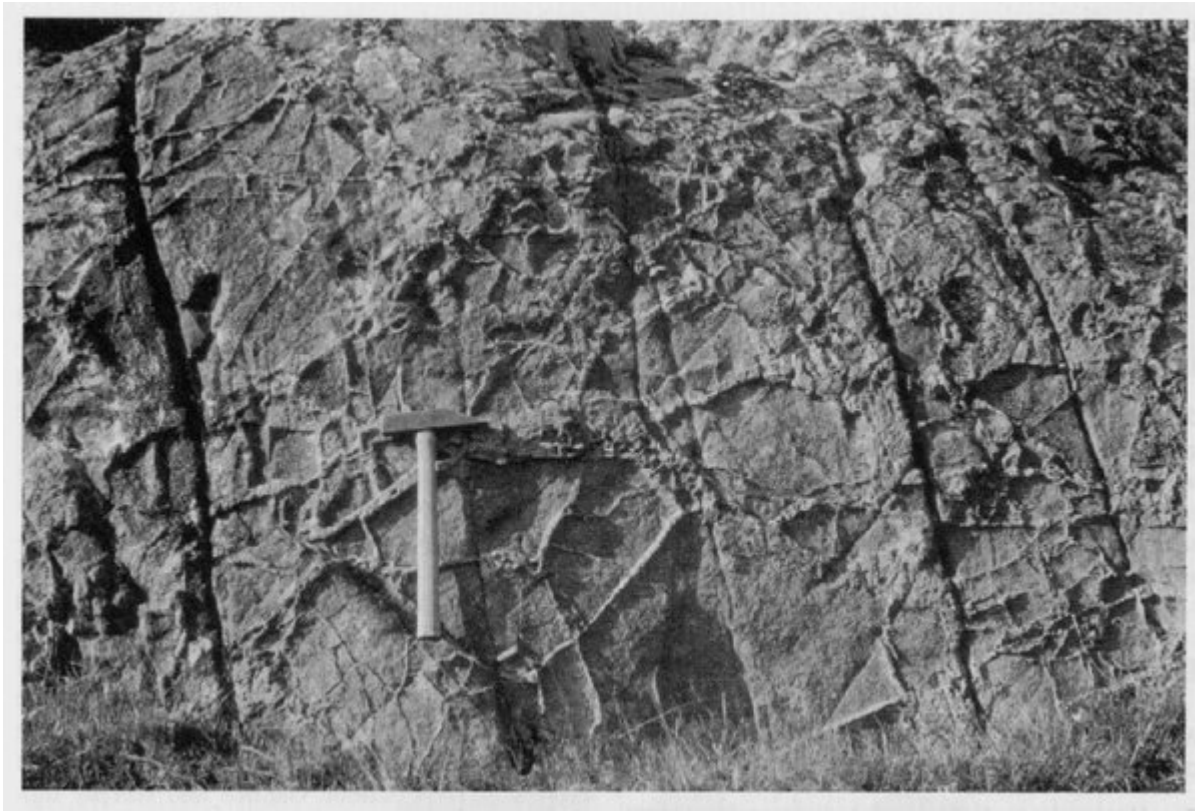
(Figure 4.8) Granitic net-veining and an intrusion breccia of gabbro and dolerite fragments. Centre 2 ring-dykes, near the lighthouse, western tip of Ardnamurchan.