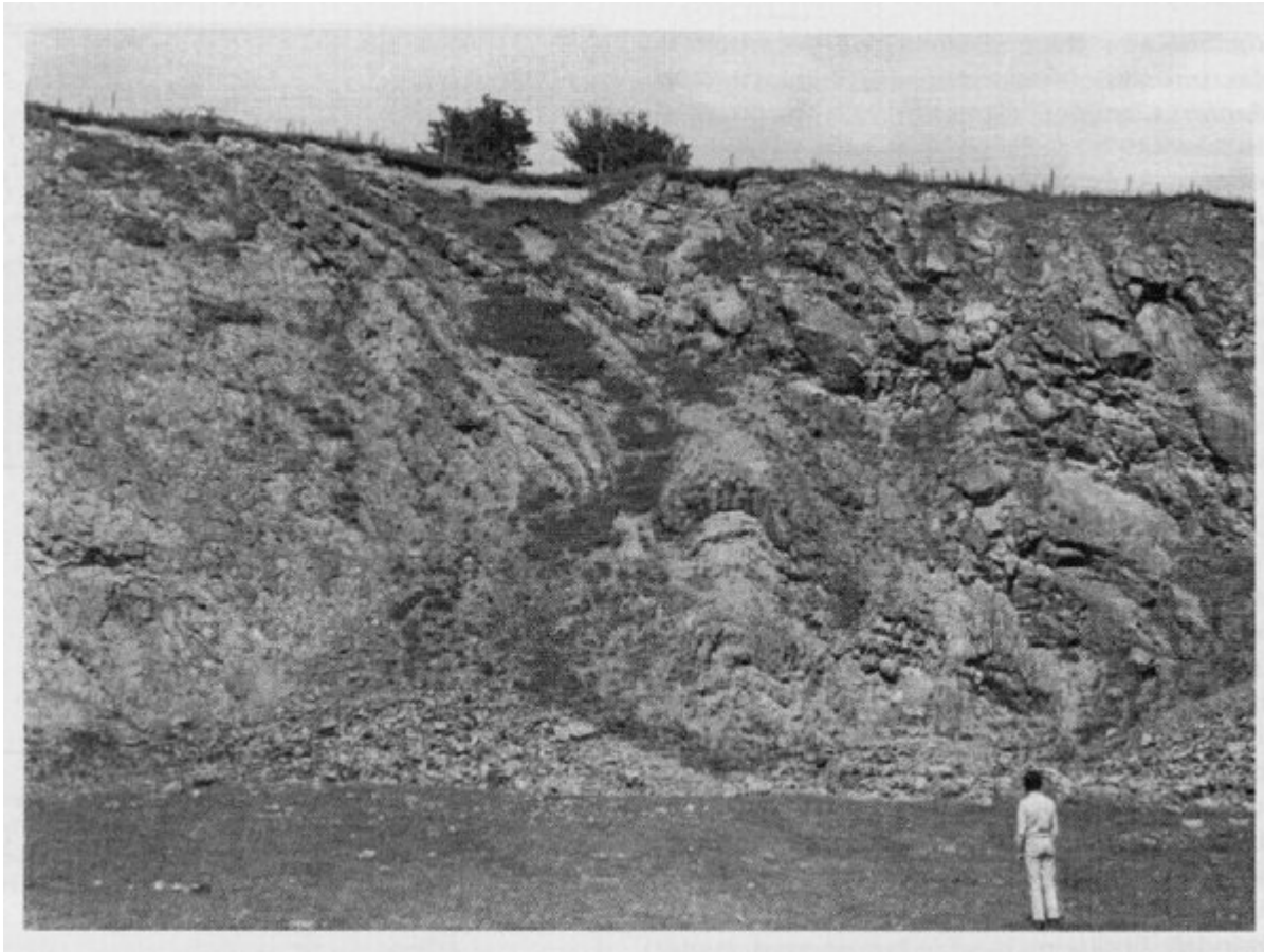
(Figure 11.15) Keisley New Quarry, the north part, showing several metres of southward-dipping limestone. The lower beds to the left are nodular with siltstone partings. The more massive overlying beds are disturbed by faulting.