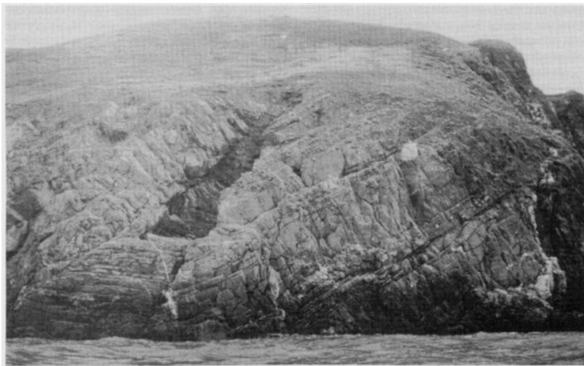
(Figure 9.14) Cliffs of Ogof Gynfor viewed from the sea. On the extreme right, surmounted by pale-weathering quartzite, is the Gwna Melange of the Mona Supergroup. It is overlain unconformably by thick sandstones and conglomeratic horizons of the Torllwyn Formation (Arenig), which are disposed in a faulted syncline; within this is a faulted wedge of dark cherry shales of early Caradoc age. The left-hand fault is vertical, whereas the right-hand one is an overthrust.