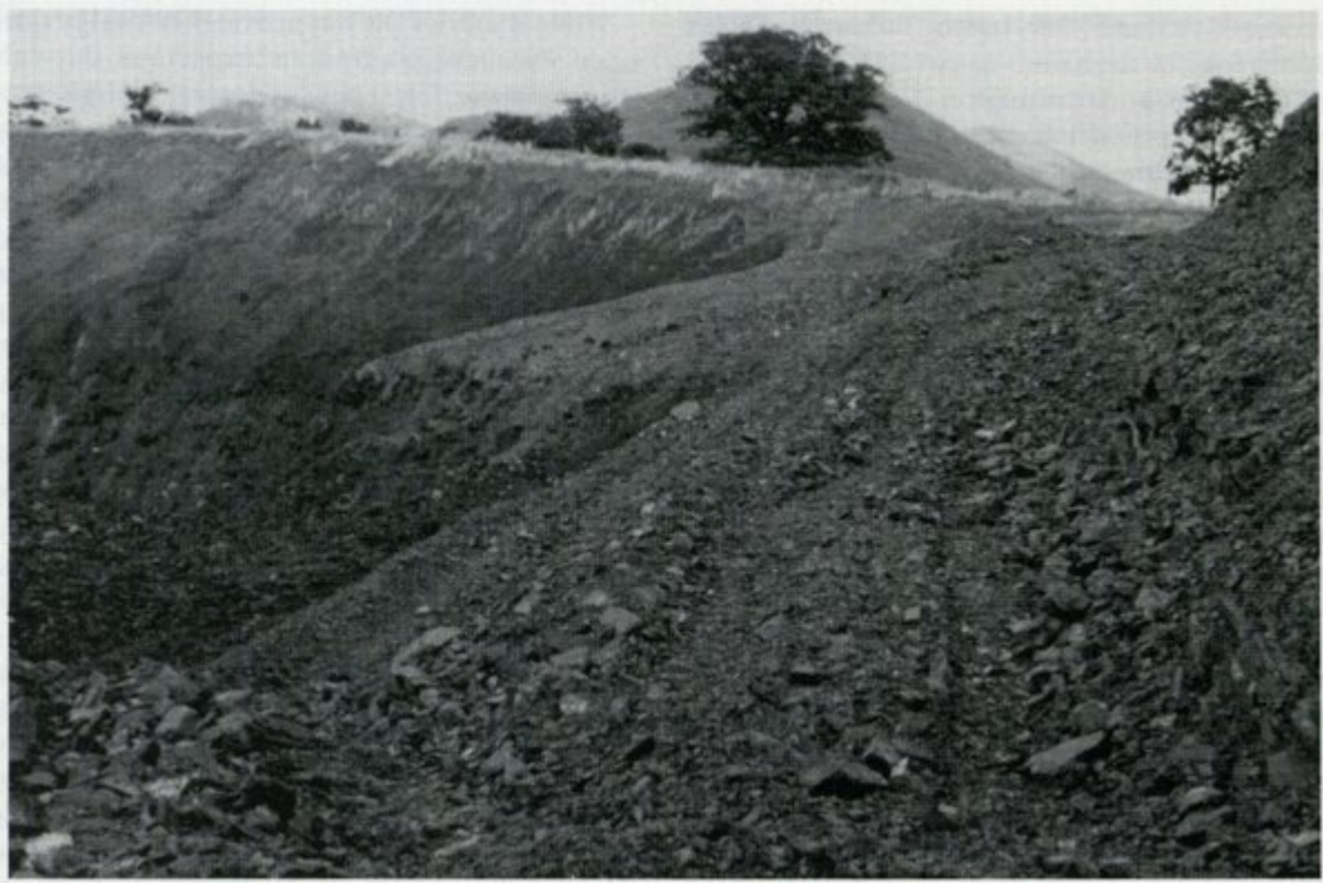
(Figure 3.17) The south-eastern part of the main (north-east) face at Buttington Brickworks, showing the upper part of the Buttington Mudstone Formation (to the left) and the lower part of the Trewern Brook Mudstone Formation.