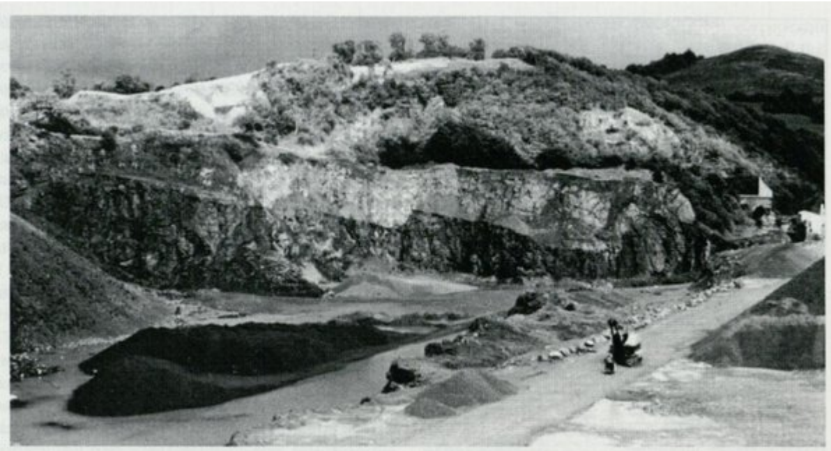
(Figure 4.41) Dolyhir Quarries, Radnorshire. Dolyhir and Nash Scar Limestone Formation (Wenlock Series) overlying Strinds Formation (Precambrian), with evidence of faulting, Strinds Quarry.