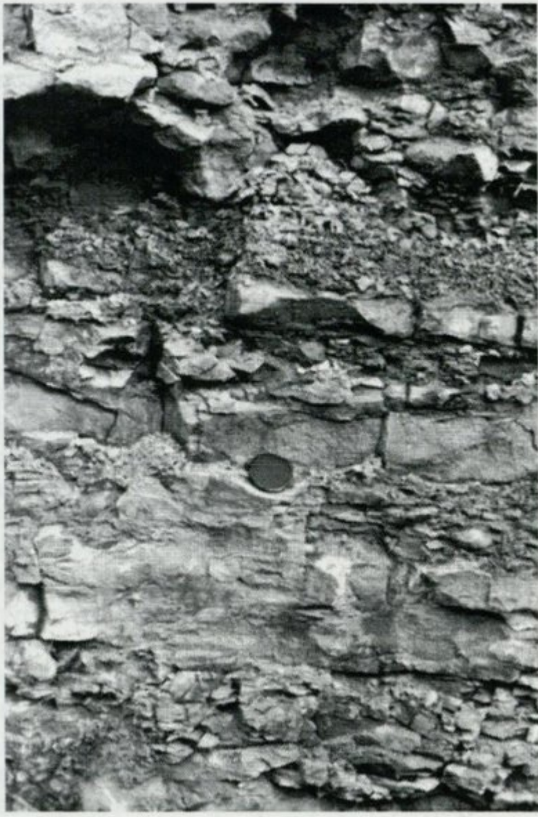
(Figure 4.32) Farley Road Cutting, between Much Wenlock and Ironbridge, Shropshire. Alternations of thin shaly mudstones and nodular limestones, Farley Member, Coalbrookdale Formation, Homeric Stage.