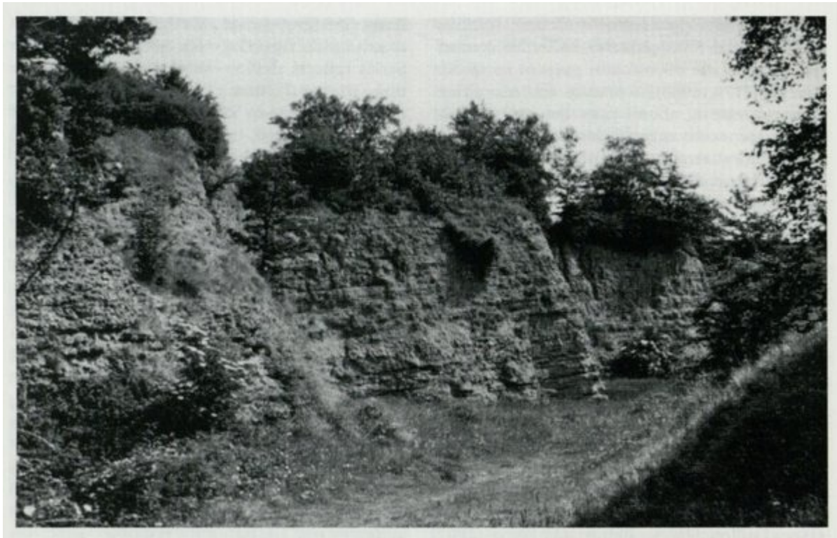
(Figure 5.45) Gurney's Quarry Ledbury, Herefordshire: Much Wenlock Limestone Formation and the calcareous mudstones and siltstones of the overlying Lower Ludlow Formation.