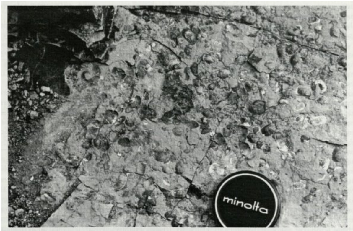
(Figure 5.49) Calcareous siltstones with shelly fauna dominated by brachiopods (e.g. S. lunata , M. nucula and P. ludloviensis ), Upper Longhope Beds, Longhope Hill (A4136 road), Gloucestershire.