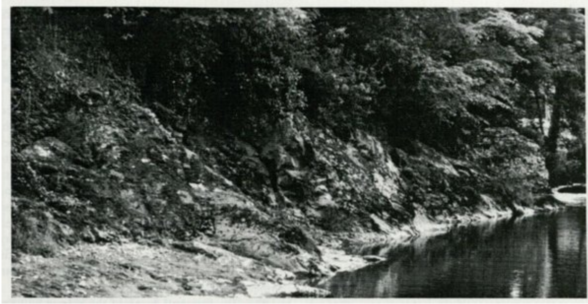
(Figure 4.44) River Irfon, Builth Wells. Right bank, looking south, about 180 m south of the bridge over the A483 road, showing lundgreni Biozone (foreground) and ludensis Biozone (river bluff, background) strata, Homerian stage, Wenlock Series.