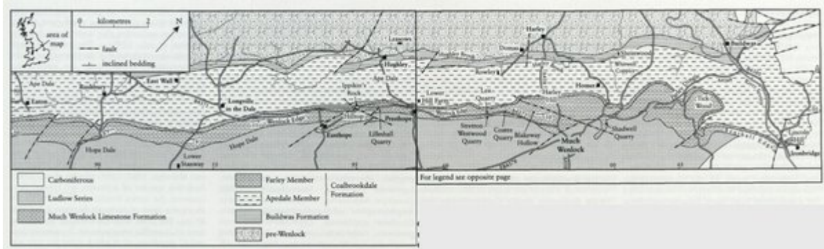
(Figure 4.27) Geology of the Wenlock Edge–Benthall Edge area between Eaton and Ironbridge, Shropshire (after Bassett et al., 1975).