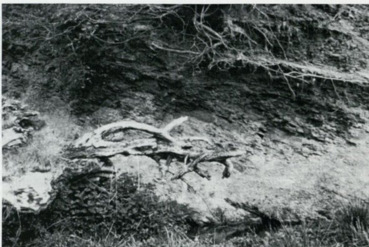
(Figure 3.8) The unconformity between Onny Shales of Caradoc age and the Hughley Shales of Llandovery age in the bank of the River Onny at Wistanstow; the Hughley Shales are exposed in the upper third of the river cliff, dipping at a lower angle than the Onny Shales.