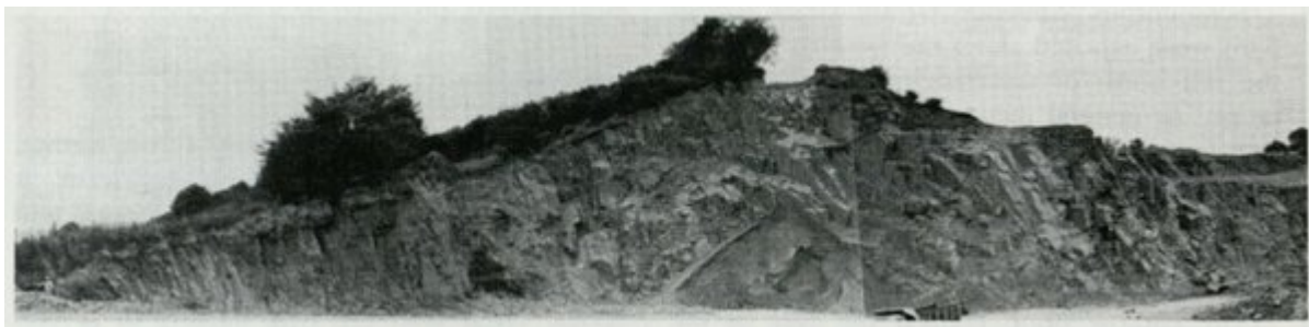
(Figure 5.44) Ludlow Series (Bringewood, Leintwardine and Whitcliffe groups) to basal Pridoli Series, Woodbury Quarry, Abberley Hills, Worcestershire; the strata young from right to left, are overturned to the east and dip 70°–80°.