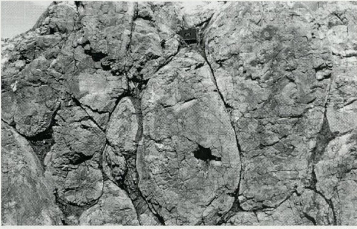
(Figure 7.20) Vertical, SE-younging basaltic pillow lavas in the Gwna Group exposed immediately north of Llanddwyn Island.