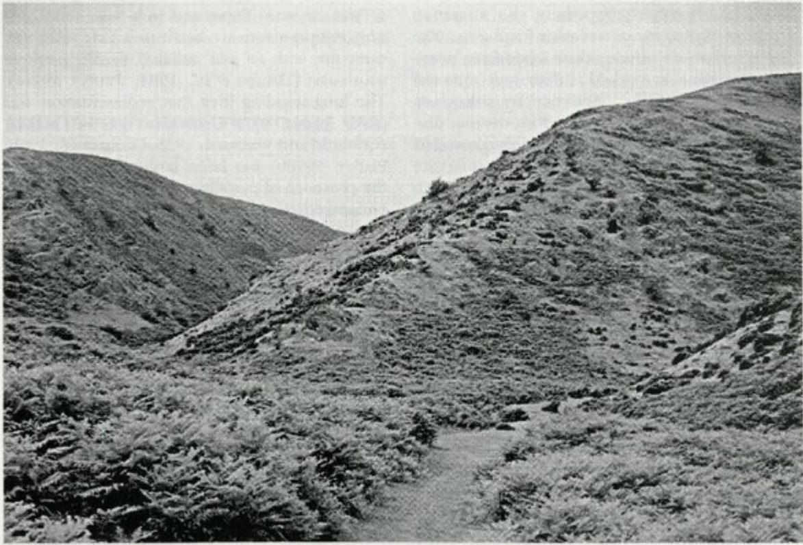
(Figure 5.14) View looking west at the junction of Long Batch (left) and Jonathan's Hollow (from right of picture). Craggs at base of spur are formed by the Andesitic Ash crossing from right to left across the spur.