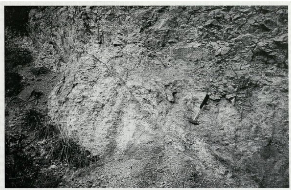
(Figure 6.4) Unconformable contact between the St David's Granophyre (Precambrian) below and conglomerates of the Caerfai Group (Cambrian) above, exposed in a farm track to the north-west of Porth Clais, St David's Peninsula, Pembrokeshire. The level of the unconformity lies at the position of the hammerhead.