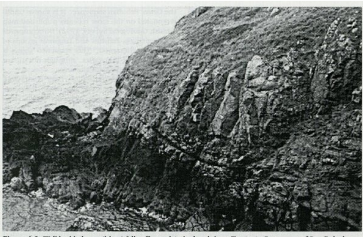
(Figure 6.3) Well-bedded, possible airfall tuffs overlain by basalt lava; Treginnis Group east of Pen Dal-aderyn, St David's Peninsula, Pembrokeshire.