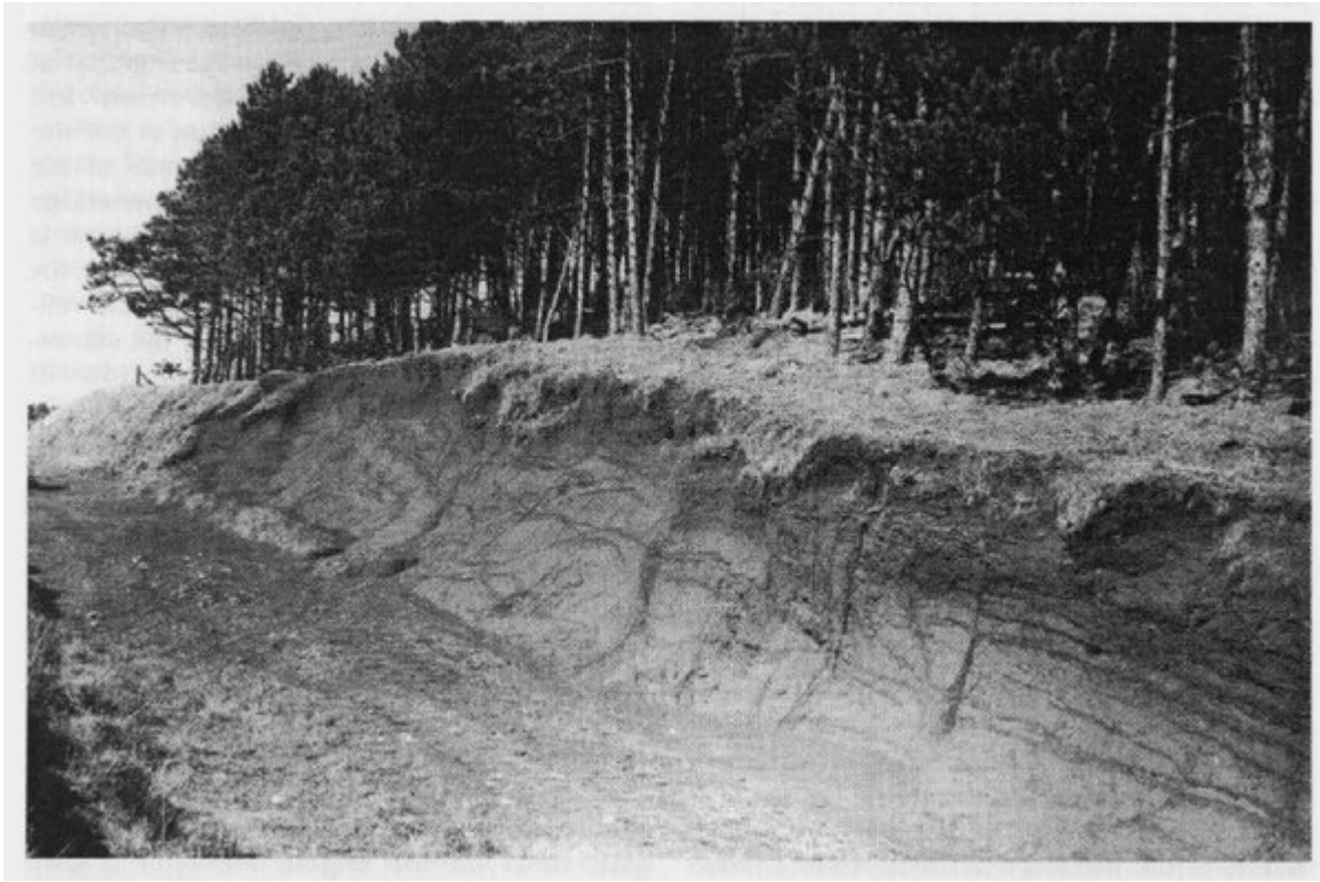
(Figure 2.29) Exposure of Abbotsbury Ironstone at Blind Lane, Abbotsbury.