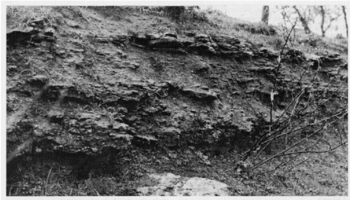
(Figure 2.46) View of the Cumnor site in 1998, showing the 1.2 m high face in flaggy-weathering Wheatley Limestone.