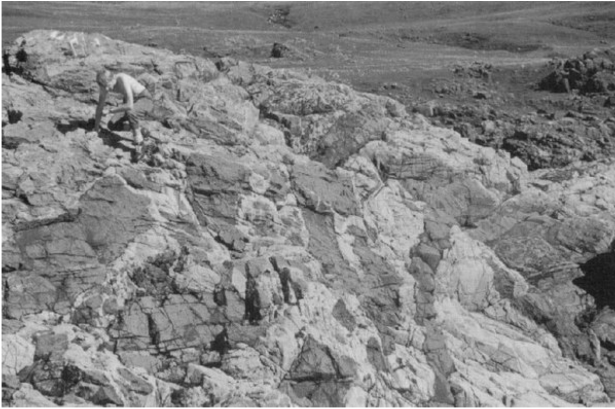
(Figure 3.12) Intrusion breccia at the contact of ultrabasic rocks with earlier granite. Eastern end of Harris Bay. Harris Bay site, Rum.