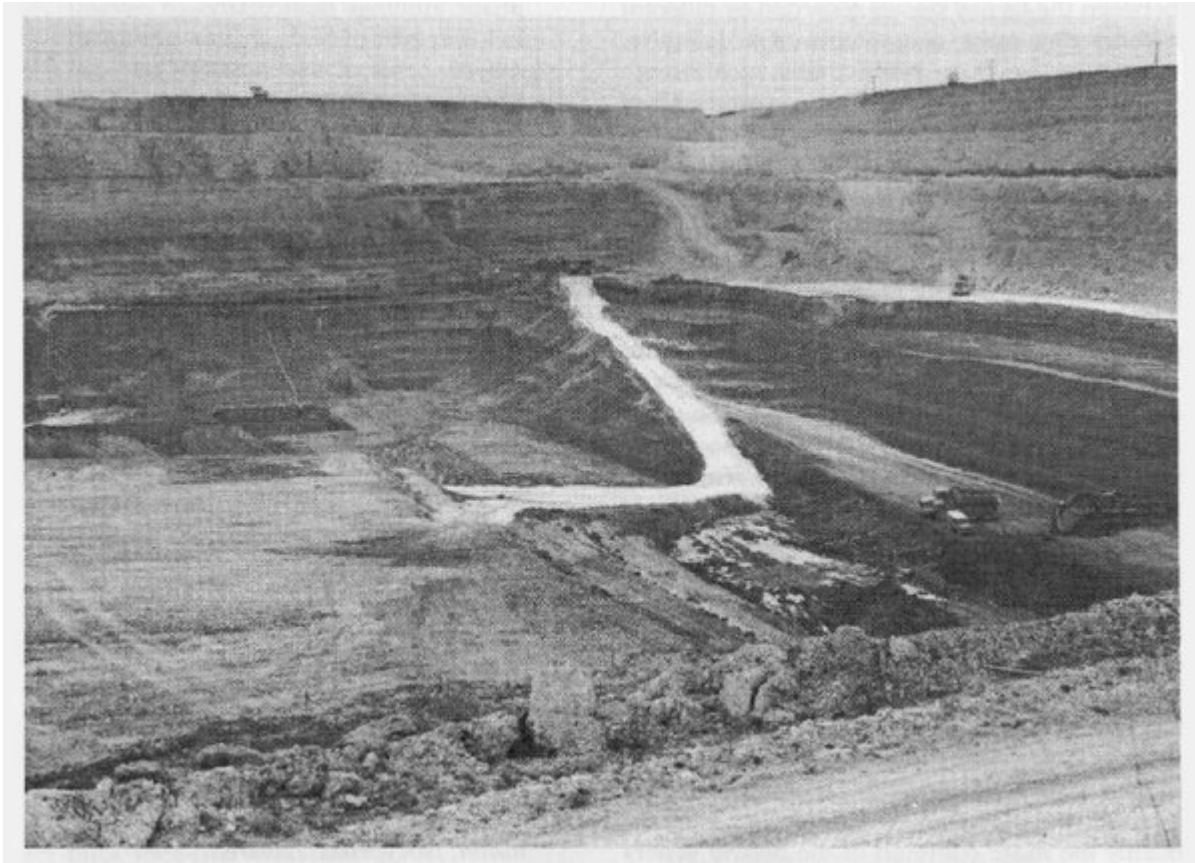
(Figure 3.10) General view of the South Ferriby GCR site in 1987.