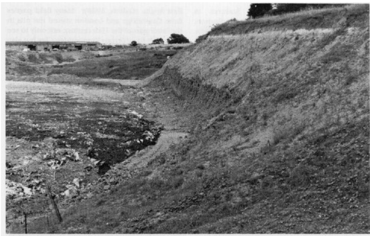
(Figure 3.7) View of the upper part of Warboys Pit showing Cordatum Zone Oxford Clay overlain by West Walton Formation, beds 9–12, with the Warboys Rock', the distinctive pale band, close to the top of the section.