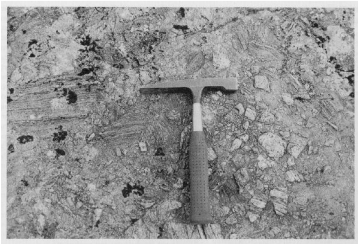
(Figure 5.19) Vent agglomerate containing fragments of Moine gneiss [NM 558 324]. Loch Ba—Ben More site, Mull.