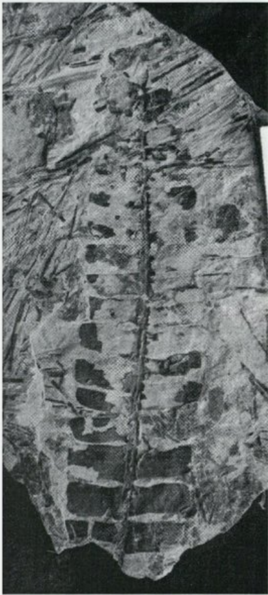
(Figure 3.47) Anomozamites nilssonii (Phillips) Harris. These bennettitalean leaves are typically 150 mm by 30 mm and divided into square-cut segments that have minutely dentate ends. Laboratory of Palaeobotany and Palynology, Utrecht, specimen S.3085, Cloughton Formation, Cloughton Wyke, x 1.5. (From van Konijnenburg-van Cittert and Morgans, 1999; photo: J.H.A. van Konijnenburg-van Cittert.)

(London), and from examining collections in that museum and the National Museum and Gallery Cardiff. Records known to fall outside the boundaries of the sites have been omitted, but those over which there is some doubt have been included.