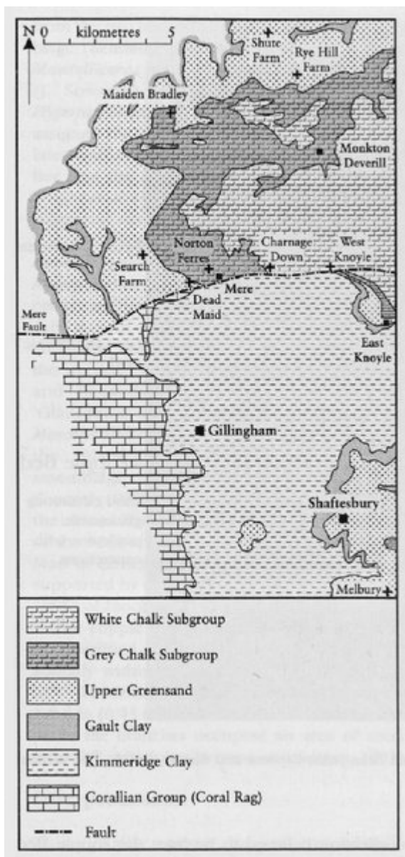
(Figure 3.39) The position of Dead Maid Quarry and Charnage Down Chalk Pit in relation to the Mere Fault and other key localities in the area. (After Scanes, 1916.)