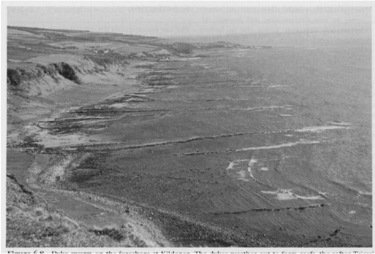
(Figure 6.8) Dyke swarm on the foreshore at Kildonan. The dykes weather out to form reefs; the softer Triassic sandstone in between has been eroded back. South Coast of Arran site, Arran.