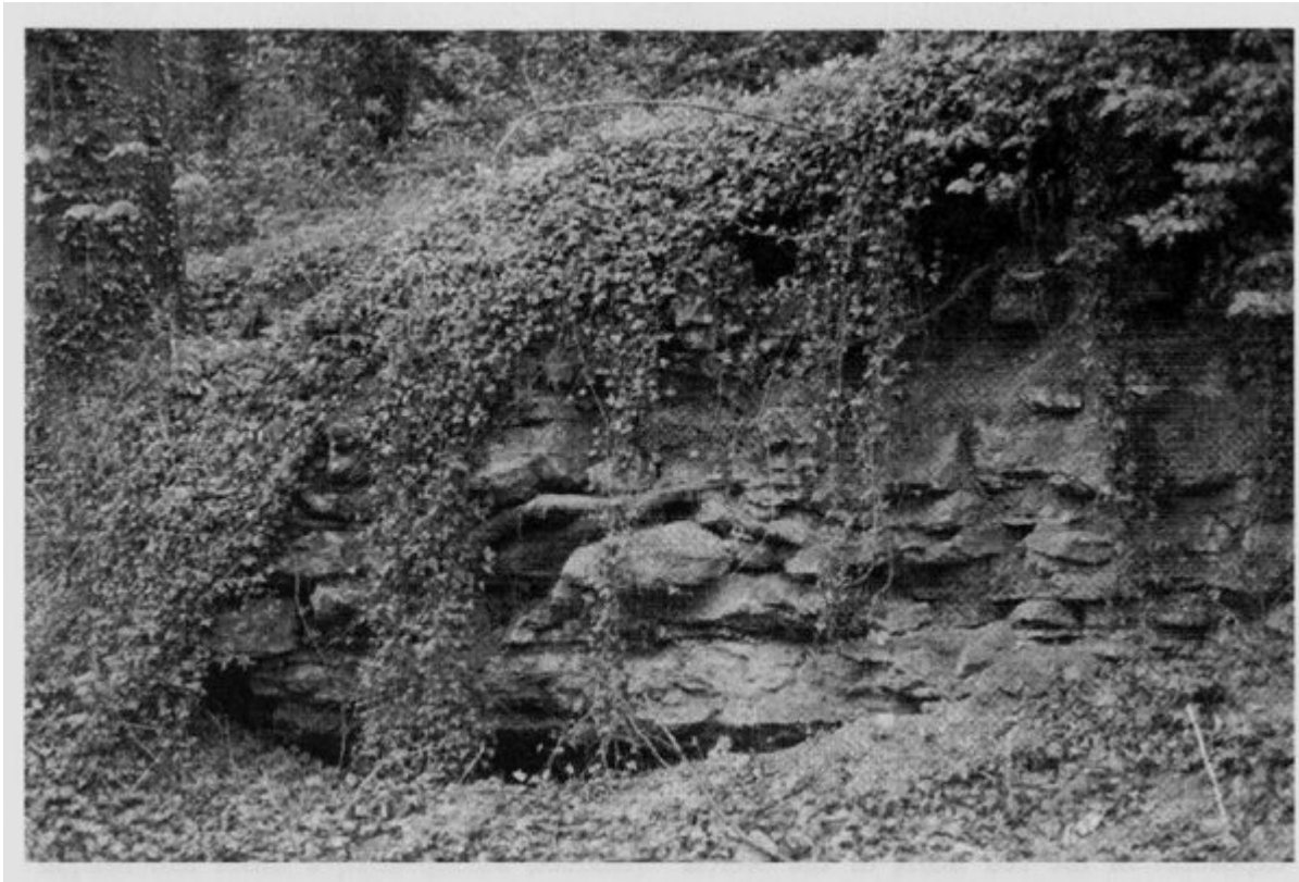
(Figure 4.16) Hapsford Bridge, view of the Penarth Group sediments, which rest unconformably on Carboniferous Limestone.