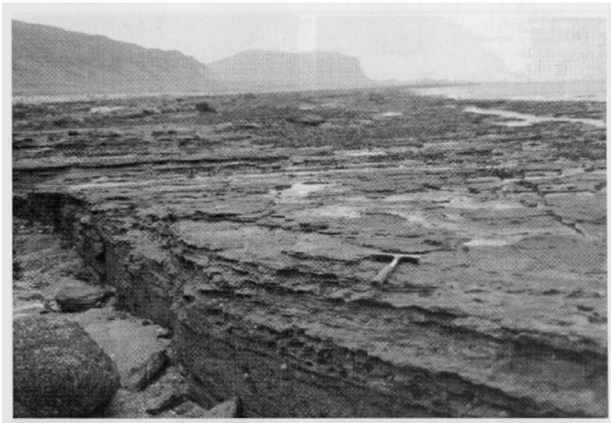
(Figure 3.16) Outcrop of red sandstones of the Lamlash Sandstone Formation on the wave-cut platform on the foreshore at Drumadoon, looking south.