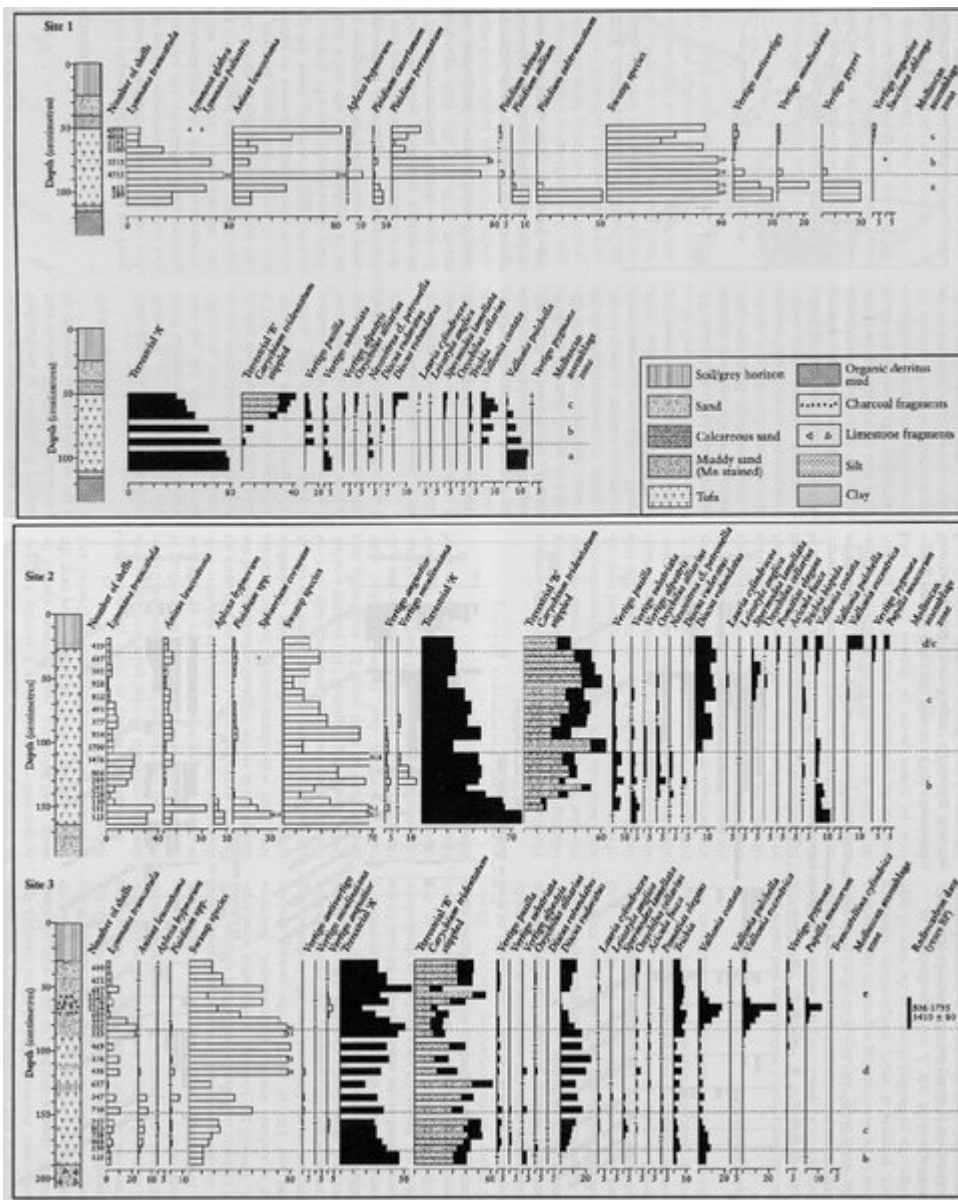
(Figure 8.119) Mollusc diagrams with lithostratigraphy of the three Castlethorpe tufa and shell marl sites (after Preece and Robinson, 1984).