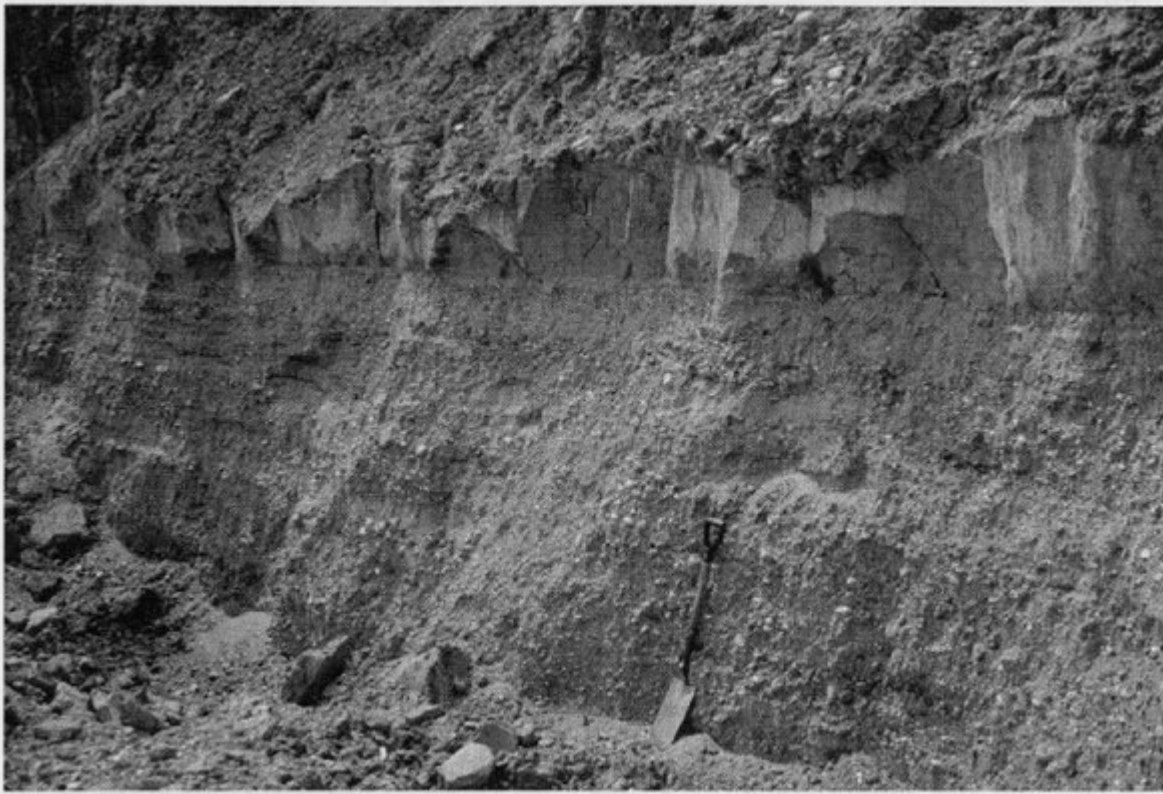
(Figure 4.30) Horizontally bedded Kelsey Hill Gravels truncated by Withernsea Till.