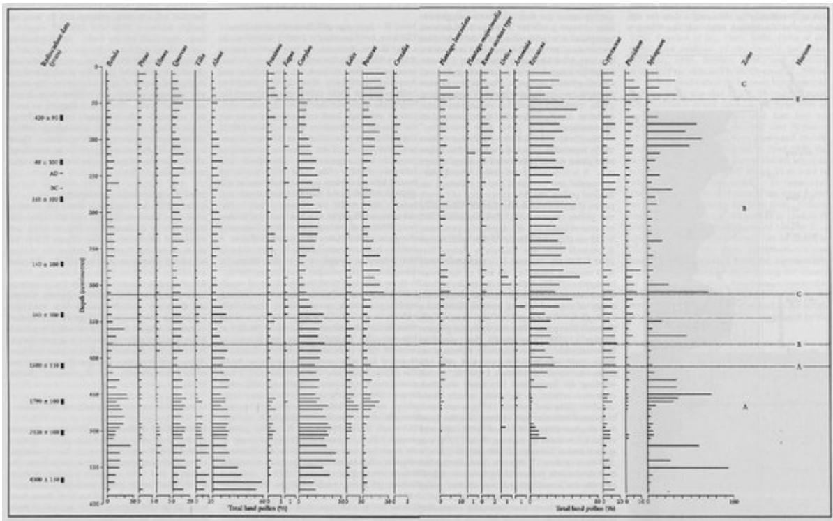
(Figure 8.64) Percentage pollen diagram from Leash Fen covering the mid- to late Flandrian. Values are expressed as a percentage of total land pollen excluding aquatic pollen and spores. Several horizons are shown that mark widespread anthropogenic and climate events in the southern Pennines (after Hicks, 1971). Dates are given in years BC and AD.