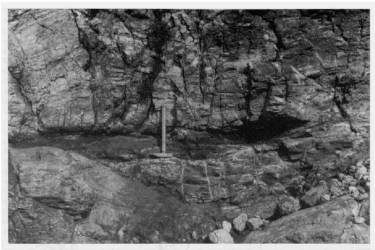
(Figure 3.21) Lenses of peridotite enclosed within later gabbro, Carrick Luz, Lankidden.