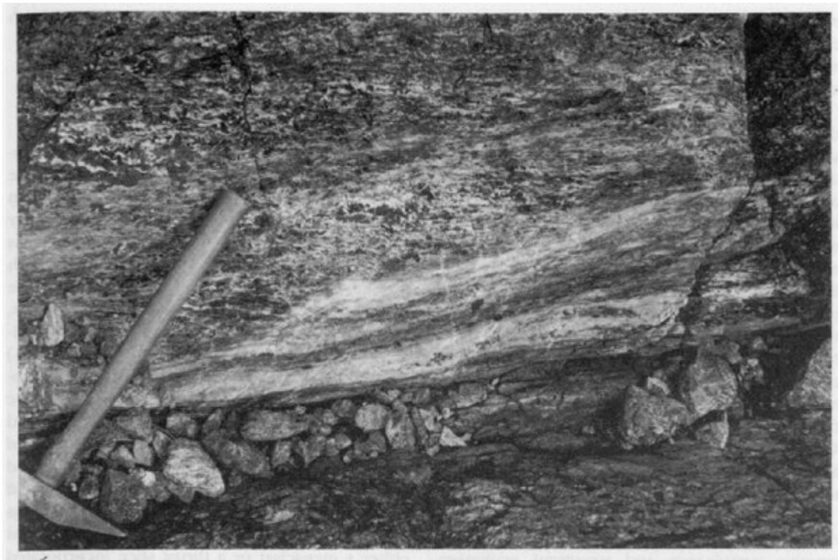
(Figure 3.23) Shear zones developed in gabbro, Carrick Luz, Lankidden.