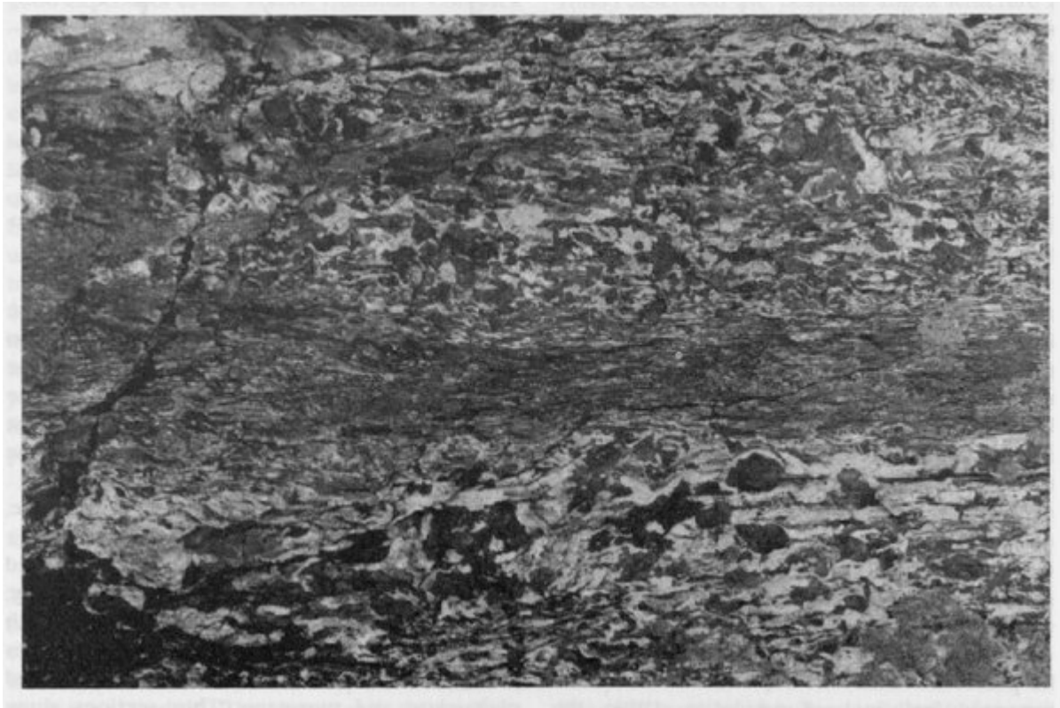
(Figure 3.22) Flaser gabbro, Carrick Luz, Lankidden.