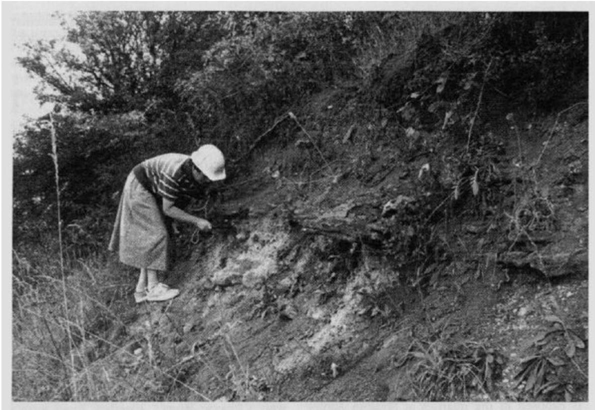
(Figure 4.13) Poorly exposed Blisworth Limestone Formation at the Blisworth Rectory Farm GCR site.