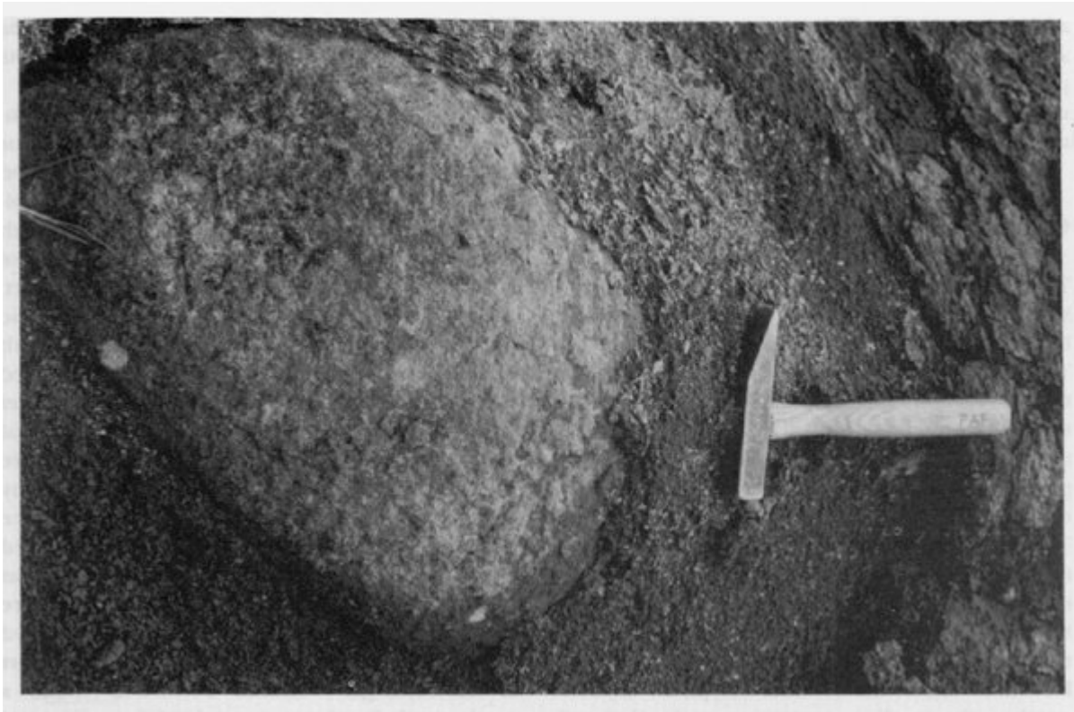
(Figure 4.33) Weathering of the Polyphant ultramafic body (hydrous picrite) showing a core boulder of serpentinite within a highly oxidized, degraded matrix. Polyphant, Cornwall.