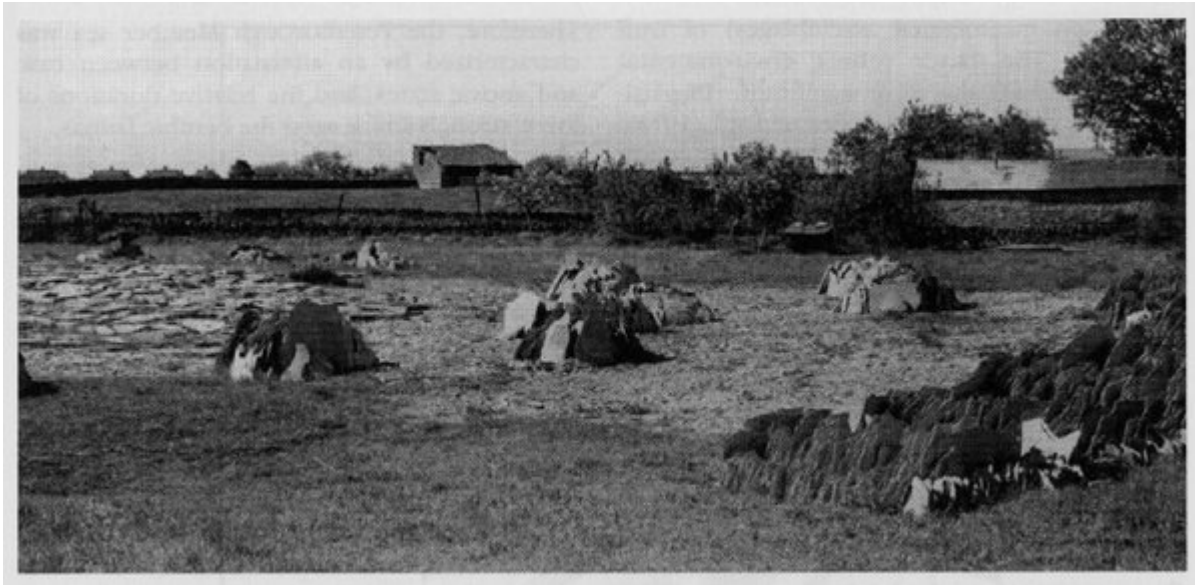
(Figure 4.28) Collyweston Slate workings showing slates stacked before trimming and slabs laid out for 'frosting'.