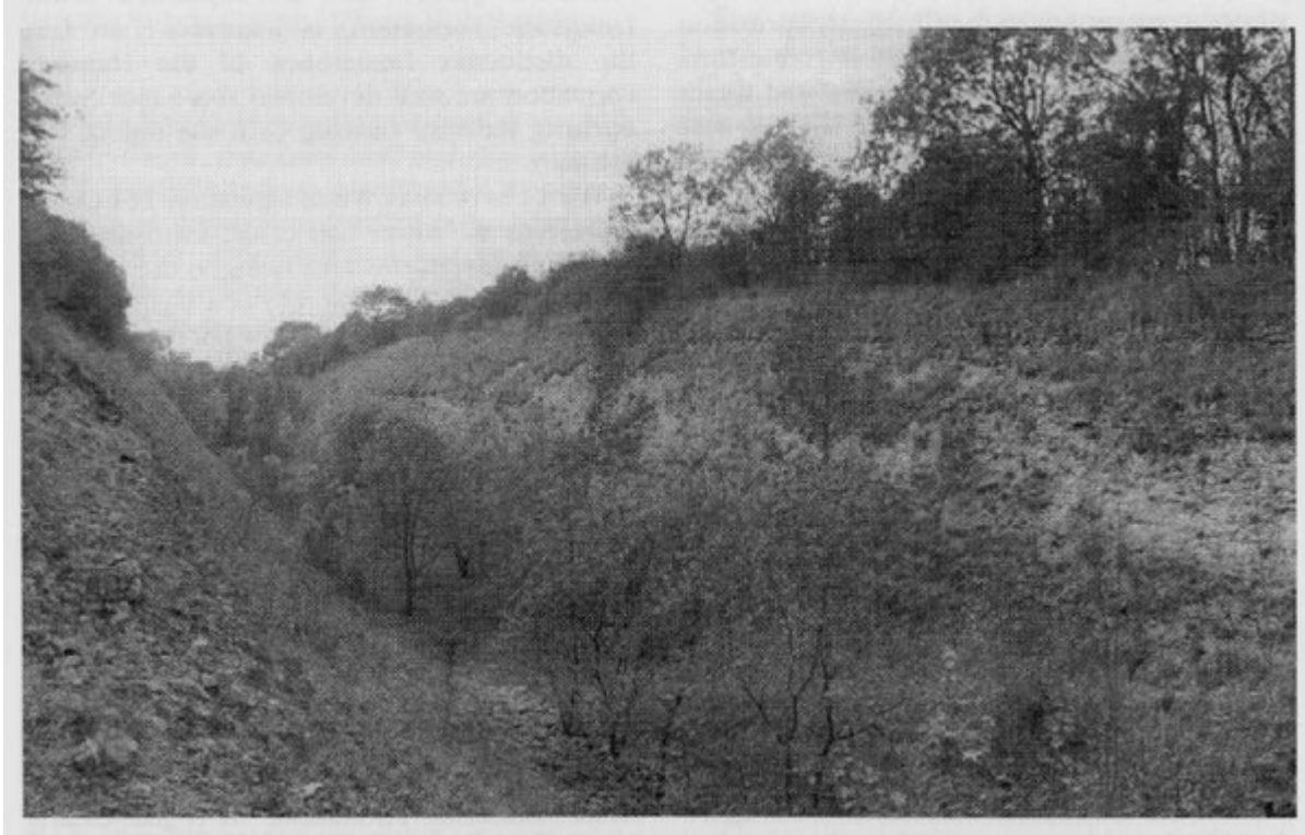
(Figure 3.50) General view looking west in the First Cutting West of Notgrove, showing the eastward dip of the Clypeus Grit Member.