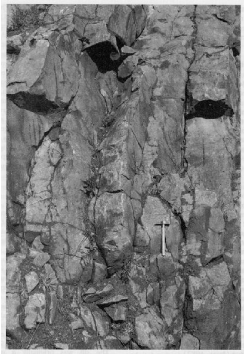
(Figure 4.42) Well-developed columnar jointing in dolerite. Pius Cleave Quarry, Tavistock, Devon.