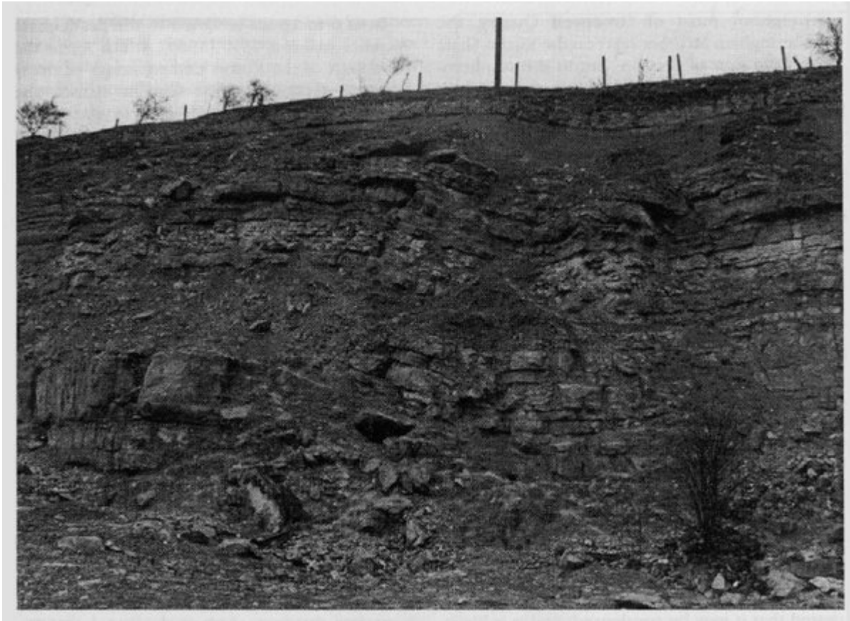
(Figure 4.44) Lower Lincolnshire Limestone at Greetwell Quarry. The Wragby Bed in the Greetwell Member is the massive bed on the left of the photograph in the lower part of the face; the paler unit in the upper part of the face is the Leadenham Member and the Kirton Shale (Kirton Shale Member of Ashton, 1980) lies near the top. The fold structure is probably a result of collapse over an ironstone mine in the Northampton Sand Formation, the top of which is visible at bottom left.