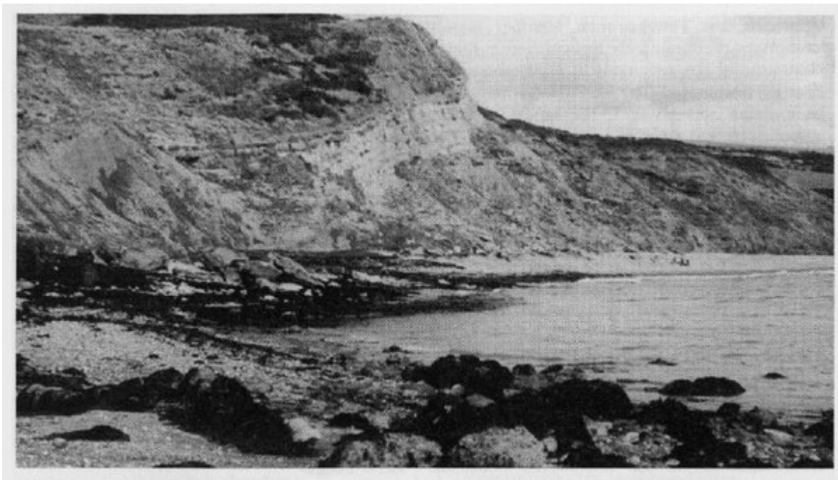
(Figure 2.9) General view of Ham Cliff from Redcliff Point. The Callovian–Oxfordian stage boundary lies in the grey clays of the Oxford Clay Formation on the right of the picture. The steep cliff is in the lower part of the Corallian Group.