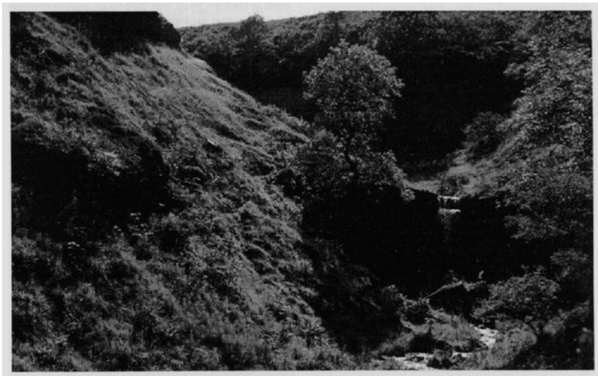
(Figure 5.21) Havern Beck, Saltergate. The Cornbrash Formation is well exposed behind the waterfall.