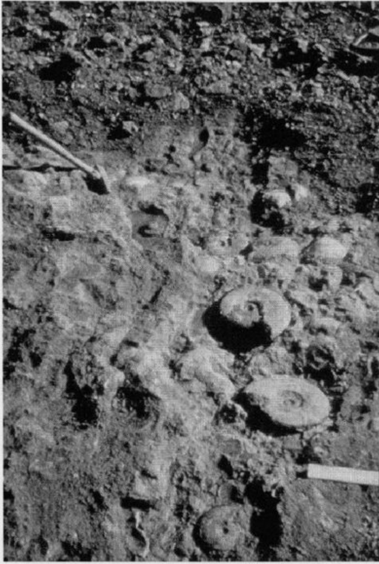
(Figure 2.19) Surface of the Horn Park Ironshot Bed (Bed 5a) with the graphoceratid ammonite Brasilia . The ruler at the bottom right is 15 cm long.