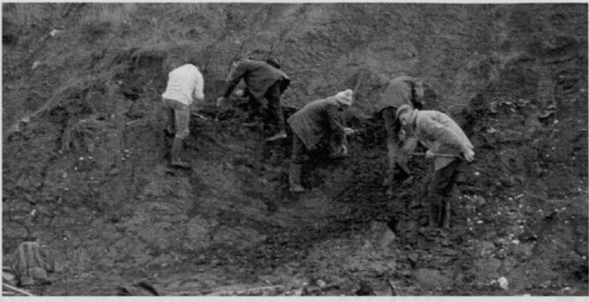
(Figure 5.16) Members of the Oxfordian and Kimmeridgian working groups of the International Subcommittee on Jurassic Stratigraphy sampling the Callovian–Oxfordian boundary sequence on the north side of Osgodby Point.