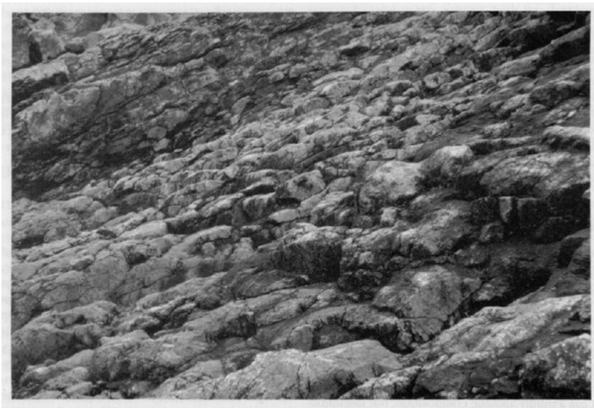
(Figure 4.10) View of the pillow-lava sequence at Clodgy Point, Penwith, Cornwall.