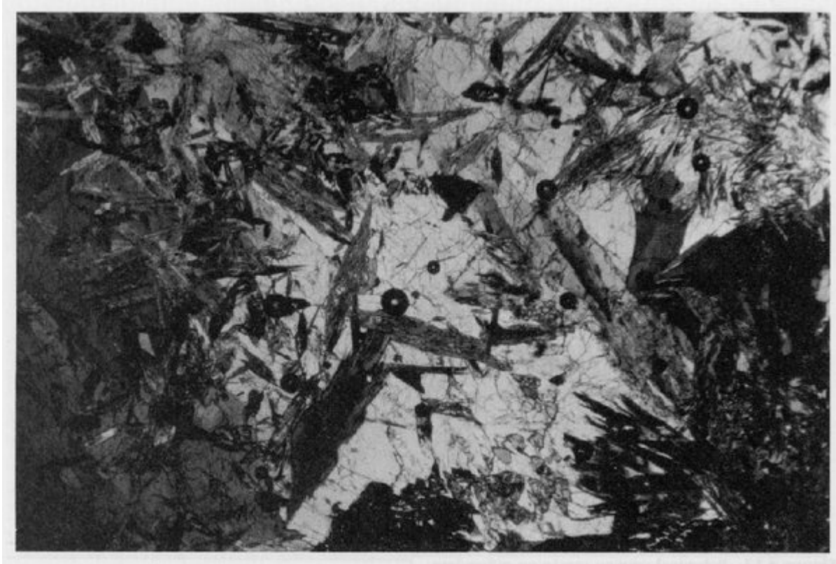
(Figure 4.14) Photomicrograph of mineral relationships in late amphibole-rich hydrothermal veins, near Clodgy Point, Penwith Peninsula (cross polars).