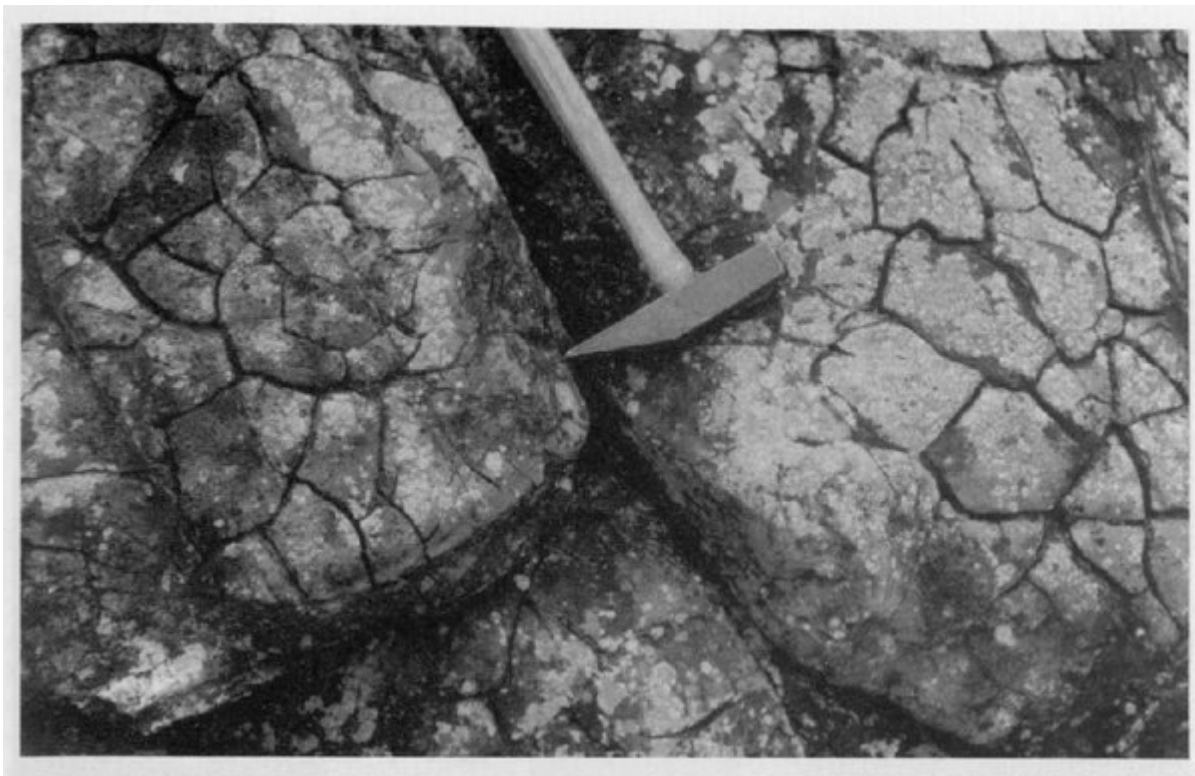
(Figure 4.12) Polygonal cooling cracks on pillow-lava sequence at Clodgy Point, Penwith, Cornwall.