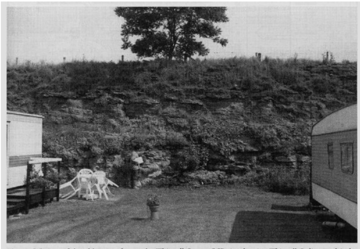
(Figure 5.5) Part of the old quarry face at the Whitwell Quarry GCR site showing Whitwell Oolite overlain by Upper Limestone. The figure's hand rests on the top surface of the Whitwell Oolite.