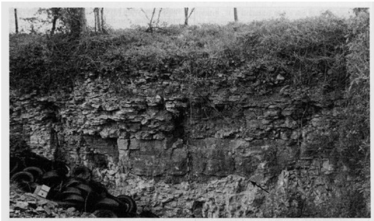
(Figure 3.23) Dodington Ash Rock Member overlying 'Minchinhampton Beds' in the quarry at Woodchester Park Farm. The boundary is marked by a black arrow. (Photo: M.G. Sumbler.)