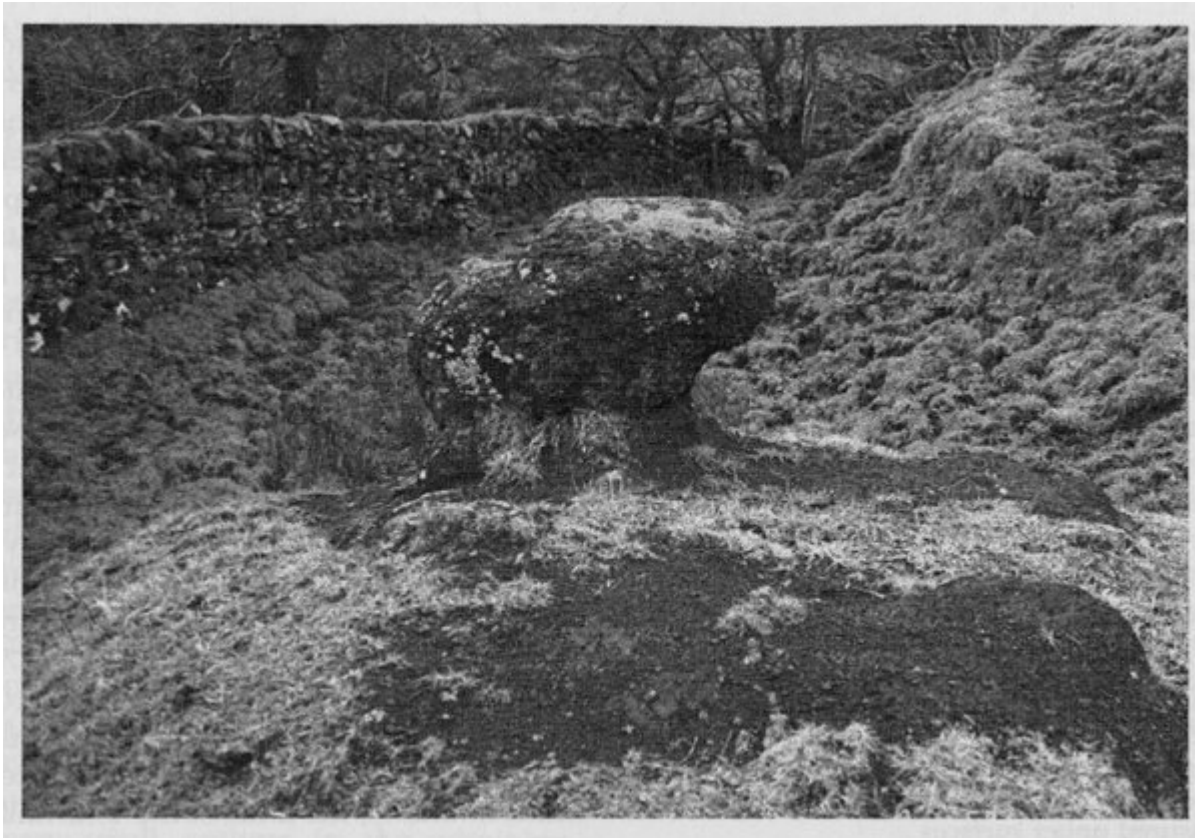
(Figure 4.14) Residual 'core' within heavily-weathered basalt lava of the Carron Basalt Formation on the west bank of the Carron Water GCR site.