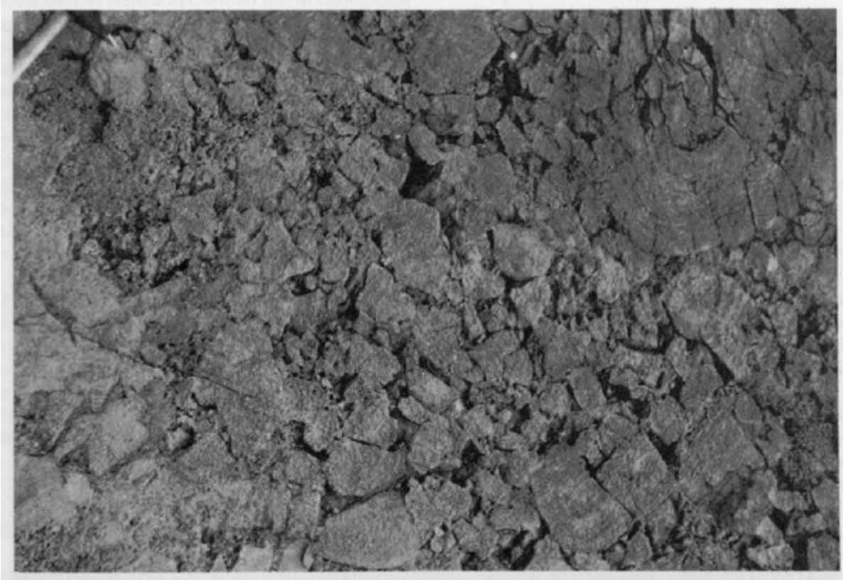
(Figure 4.24) Pillow-lava breccia formed by fragmentation on cooling soon after submarine extrusion. Pentire Point, Cornwall.