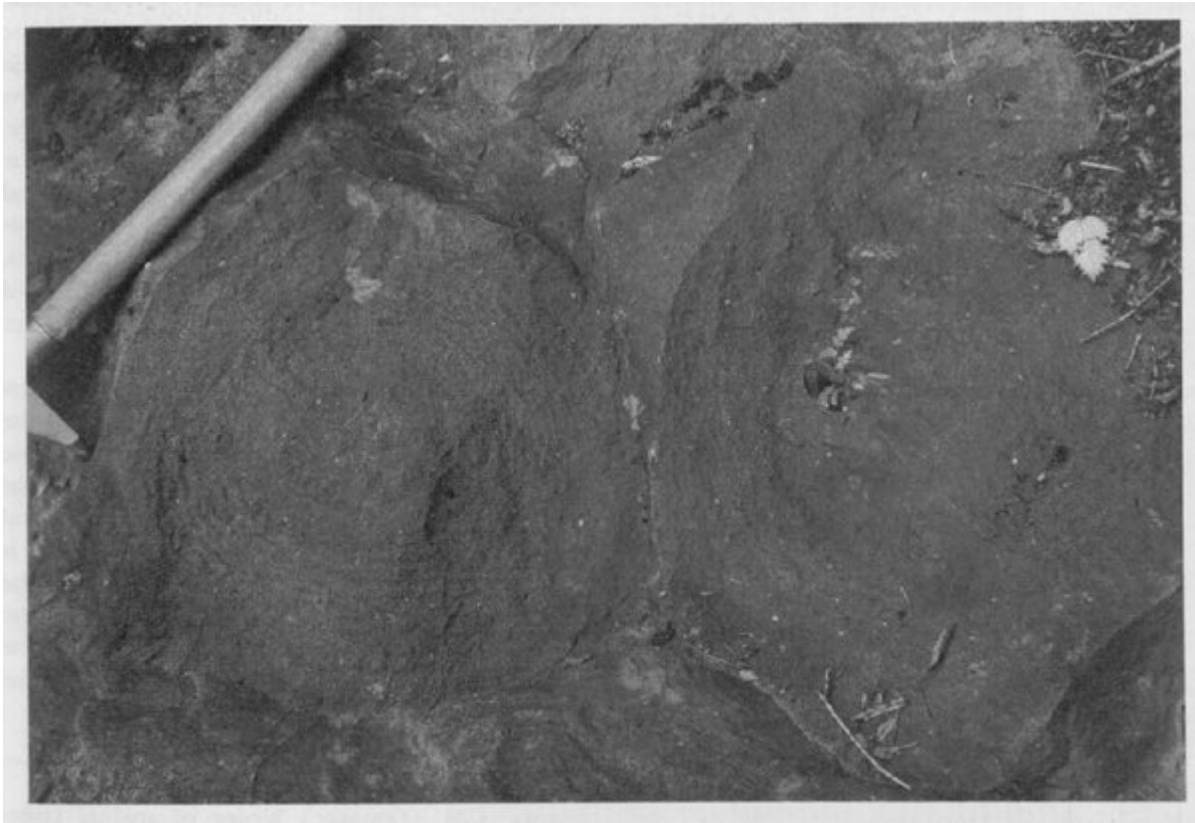
(Figure 4.27) Cross-section through two pillows showing the high degree of vesicularity and its concentric disposition. Chipley Quarries, Devon.