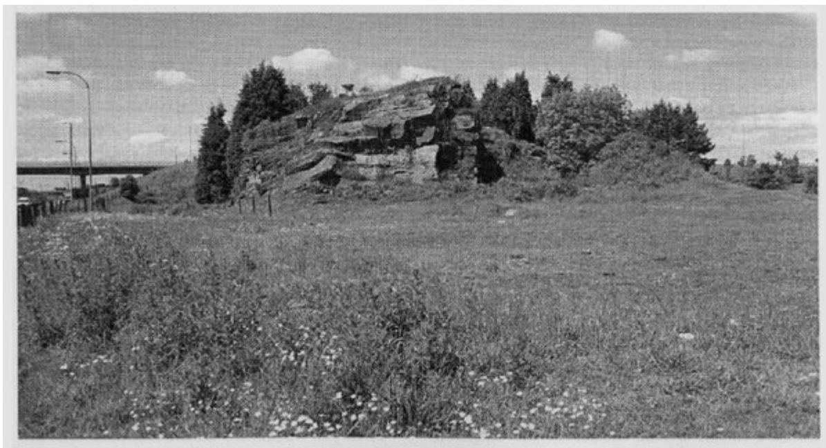
(Figure 6.19) E–W-trending quartz-dolerite dyke exhibiting good horizontal columnar jointing at Mollin Craig, Mollinsburn Cuttings GCR site.