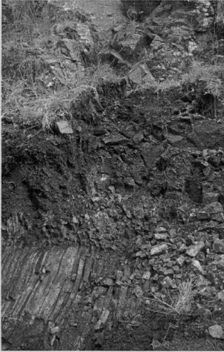
(Figure 7.9) Temporary exposure (July 2002) at the base of the Tideswell Dale Sill, on the east side of Tideswell Dale (Location B on (Figure 7.8)). The sill forms the massive natural exposures at the top of the picture and is underlain by altered basalt lava in the centre. Beneath this is a red clay with sigmoidal prismatic joints that is interpreted as a thoroughly altered lava. See text for further discussion. The cutting is 0.8 m deep.