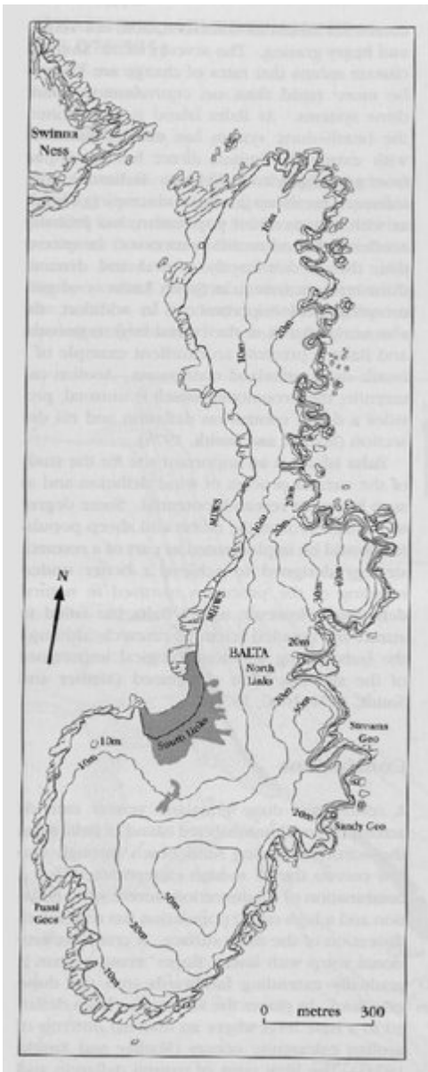
(Figure 7.30) Balta Island, Unst, Shetland, is low in the west and high in the east. It is mainly rocky except where sand is blown up-slope from the beach at South Links. (After MacTaggart, 1999.)